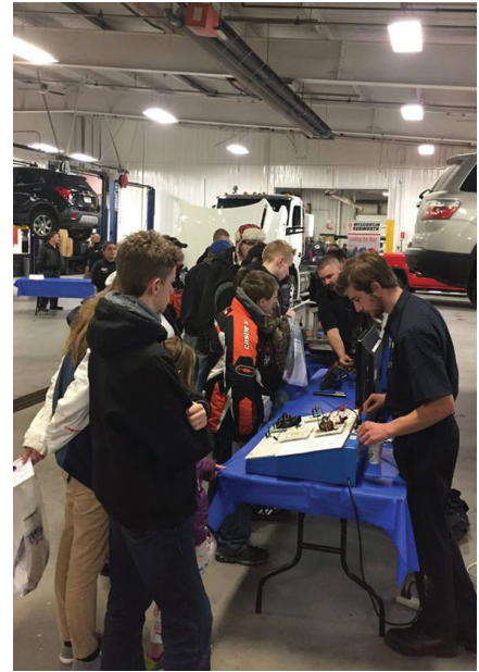
2018 CAREER NIGHT - students and parents attend this annual event to learn more about the transportation industry